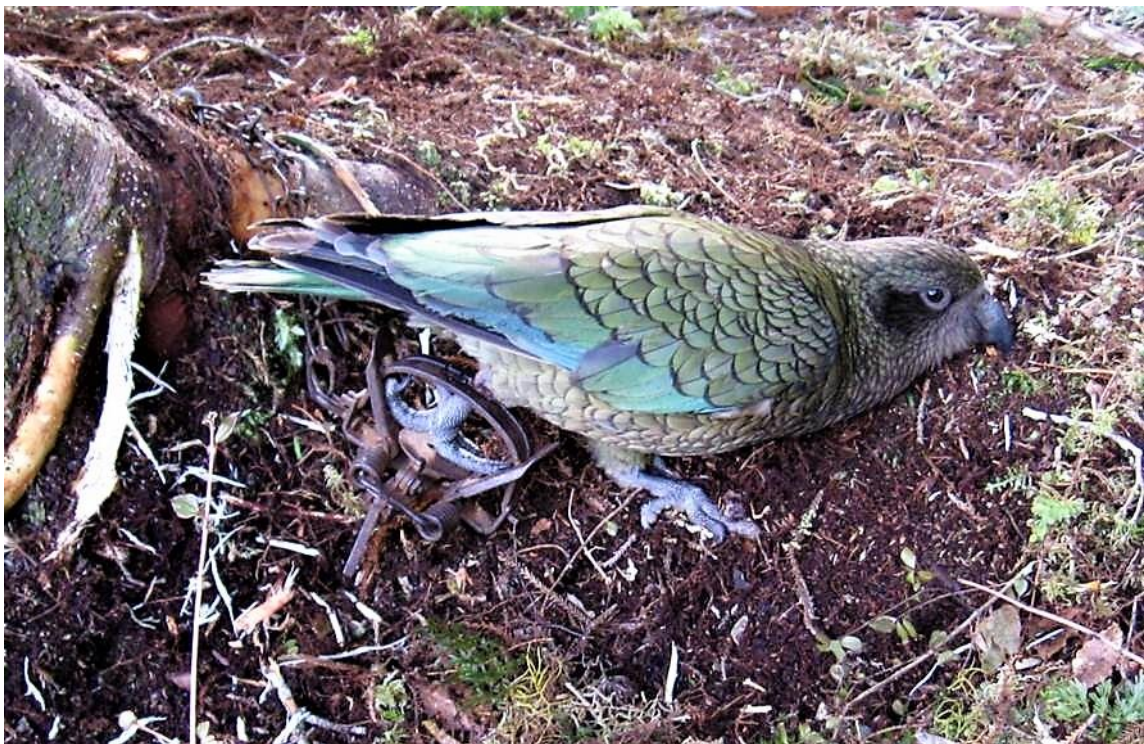
Female kea caught in a leg hold trap on the West Coast.