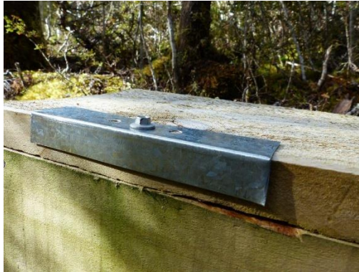
Galv bracket to protect timber around top screw