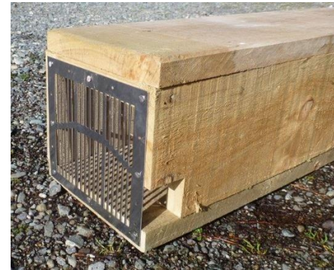
SS mesh to stop kea inserting sticks into trap. Side access only