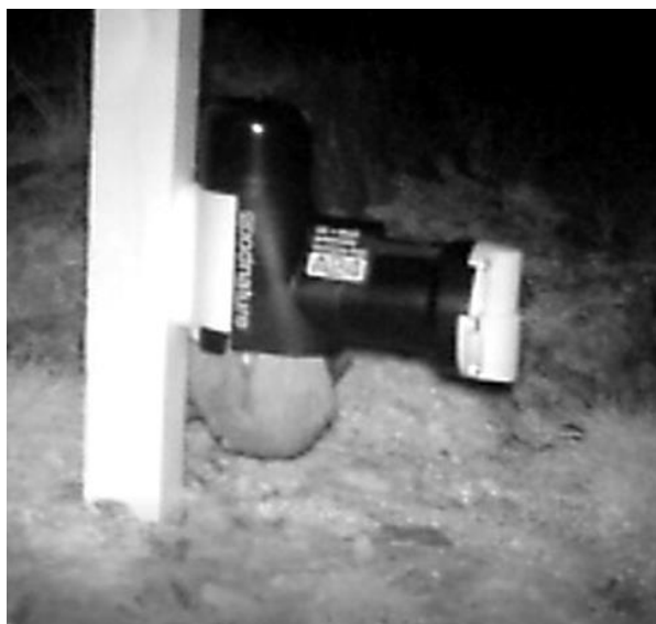
A kea with its head inside a Goodnature A24 (with no parrot excluder) 2017.