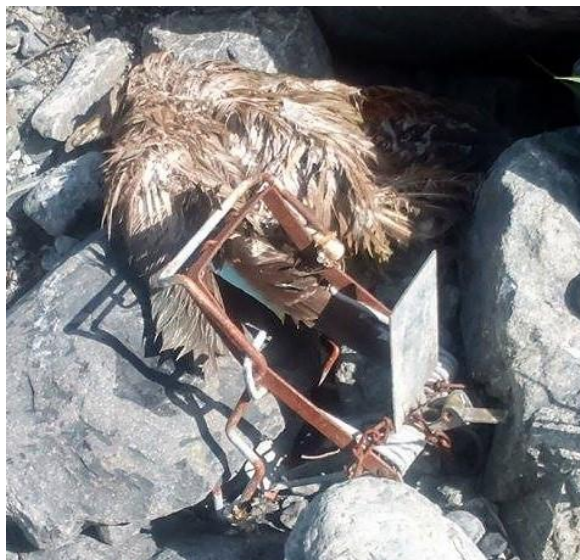
A kea killed in a Fenn trap.