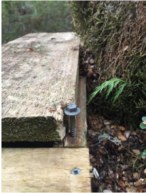
Kea damage around top screw