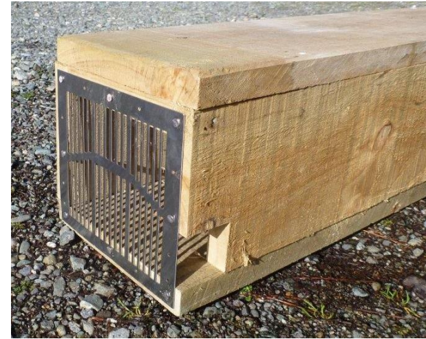
SS mesh to stop kea inserting sticks into trap. Side access only