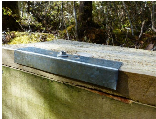
Galv bracket to protect timber around top screw