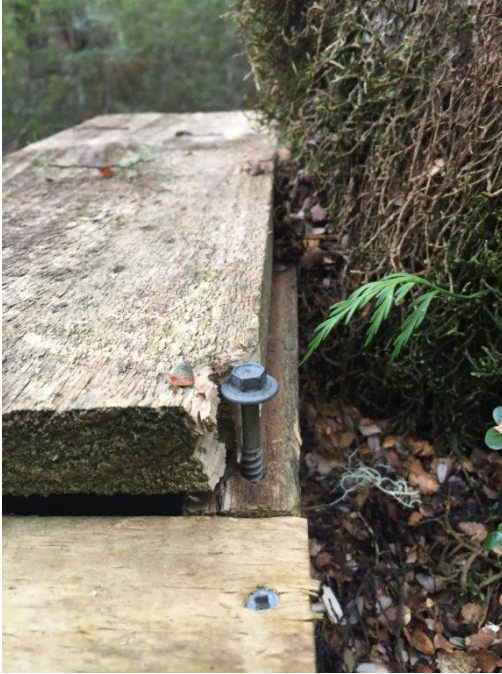
Kea damage around top screw