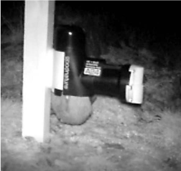
A kea with its head inside a Goodnature A24 (stoat and rat trap) 2017.