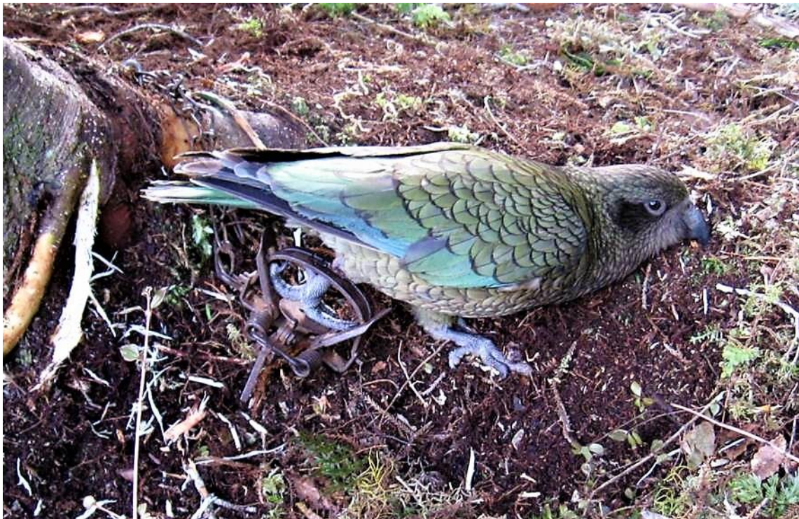
Female kea caught in a leg hold trap on the West Coast.