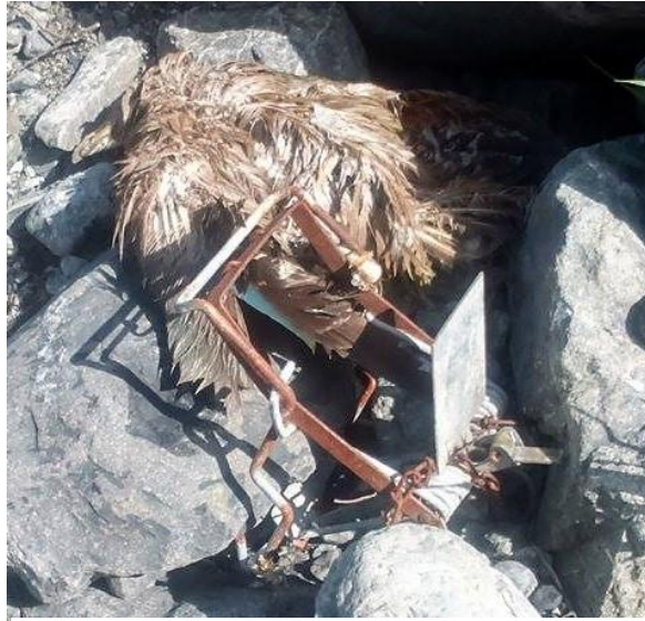
A kea killed in a Fenn trap.