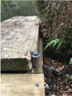
Kea damage around top screw