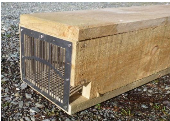
Photo 6: SS mesh to stop kea inserting sticks into trap. Side access only