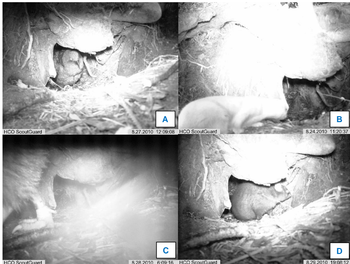
Photo 2: Kea prostrating nest (A) also being visited by stoat (B), Rowi kiwi (C) and possum (D)

between July to February each year. Results of research on kea productivity shows critically low nesting success (c.5%) during stoat plague years (following beech and/or rimu mast events) in areas without pest control, versus high nesting success (c.75%) in areas with effective kea appropriate pest control (Kemp et al, 2182). As ground feeders, the adults of both sexes may be ambushed by stoats and feral cats while foraging (Kemp et al, 2022). Predator control increases the chance of adult survival and therefore improve population dynamics and resilience in occupied habitat. However, juvenile birds disburse from natal sites and flock up in alpine areas which may not have any pest control activities. Being young and behaviourally naïve, they are vulnerable to life threatening events such as predation, accidental drowning, or consuming toxic material like lead, rubber, or poisons.