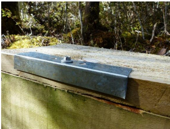
Photo 5: Galvanised bracket to protect timber around top screw to prevent damage as shown in Photo 4. This should be one of three closure points.