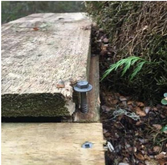
Photo 4: Kea damage around top screw of a typical DOC series trap box, not modified for use in kea habitat. Box lid is no longer secured and kea can access traps.