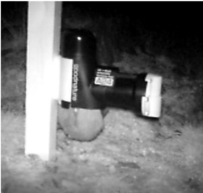
Photo 8: A kea with its head inside a Goodnature A24, with no parrot excluder, 2017